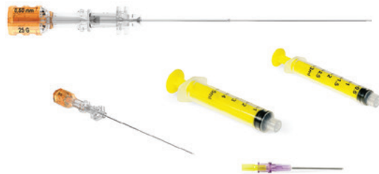
SPROTTE® - Spinal fit with NRFit™ connectors

PAJUNK® will actively accompany and support the transition process in your facility! Our staff is ready to advise and assist you with upcoming NRFit™ product questions!