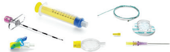
EpiLong Soft - Epidural fit with NRFit™ connectors